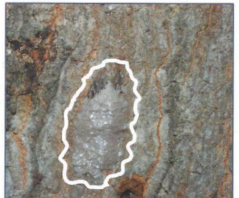
Fresh Spotted Lanternfly egg mass on tree bark (outlined in white). Present in fall and winter, blends in with surroundings.