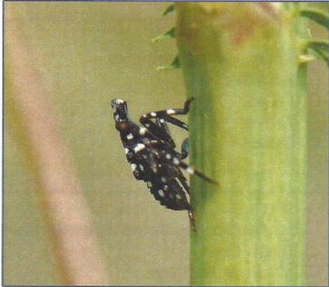
Nymph found in late spring / summer.