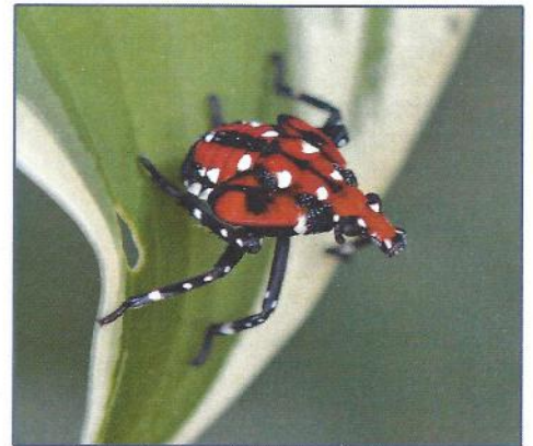
Nymph found in summer prior to adulthood.