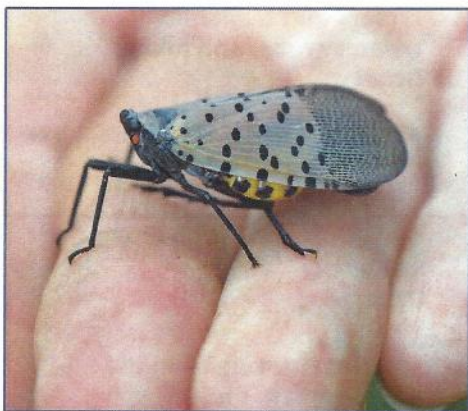
Adult - late summer / fall.

Suspected specimens of any life stage can be collected and placed in a vial or plastic zip-lock bag with the name and contact information of the collector, and turned in to the Delaware Department of Agriculture CAPS program for verification.